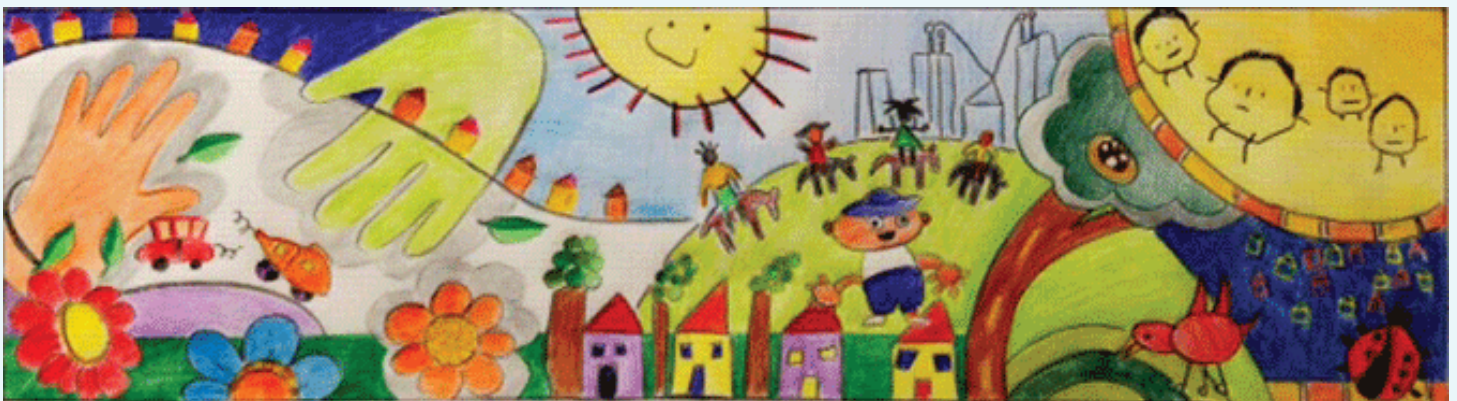
Artist rendering of the final mosaic design incorporating community drawings.

When we work together, the pieces really fit into a work of art!